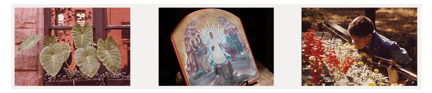
Resurrection Universal Restoration